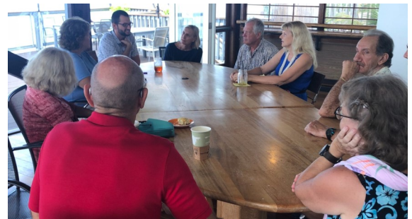
Mediator Meet and Greet, Kailua-Kona