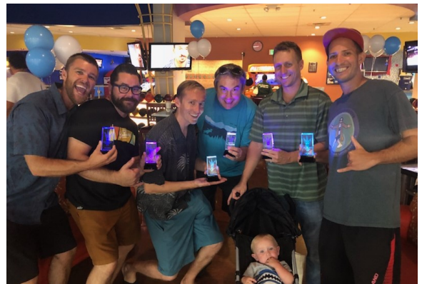
2018 Bowl for Peace Winners