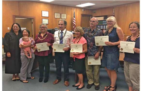
Conflict Resolution Day 2018