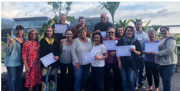
2018 Basic Mediation Training Certificate Recipients