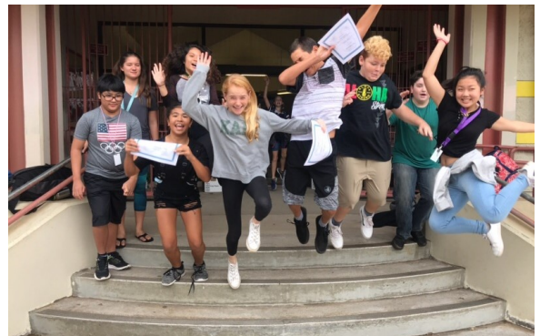
2017-18 Waikoloa Middle School Peer Mediators

91% of youth in our Peer Mediation program enjoyed being a Peer Mediator.