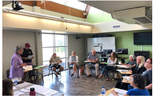
Volunteer Mediator Refresher Training