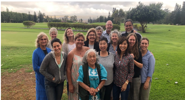
2019 Basic Mediation Training Certificate Recipients