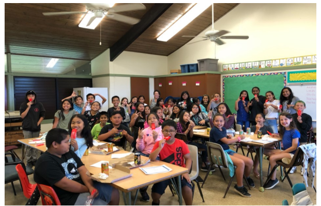
End of the Year Party for Honokaa Peer Mediators