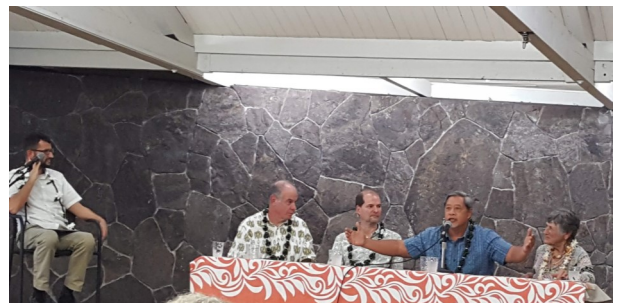
If Crime Wounds, Justice Heals Conflict Stories