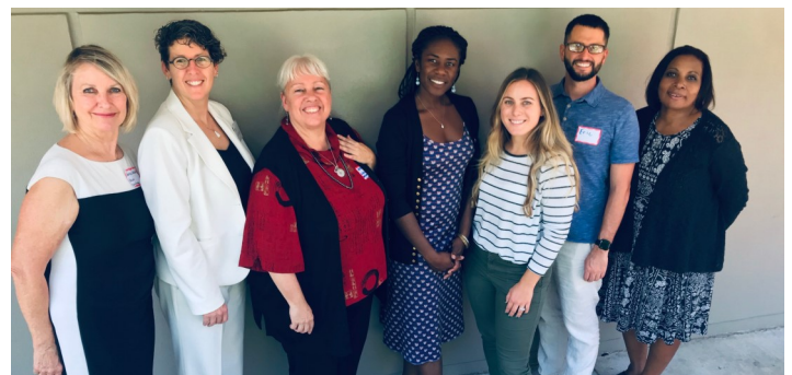
All Islands Mediation Centers Staff at Access to Justice