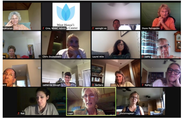
Basic Mediation Training via Zoom 2021