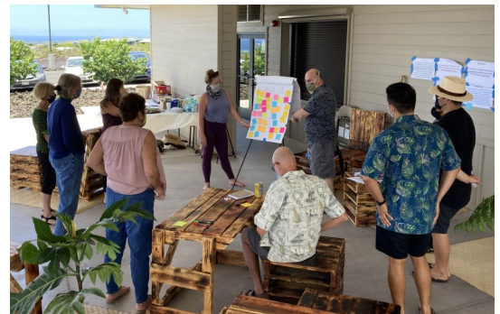
Strategic Planning Meeting 2021