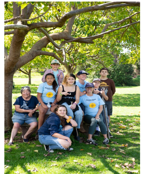
Peace Camp 2021