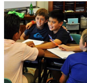
Mock Mediations at Parker School