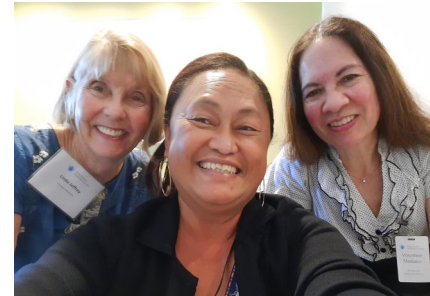
Volunteer Mediators Attend Kona Court