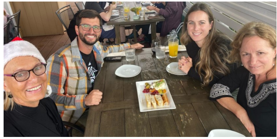
Staff Holiday Lunch December 2022