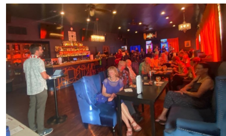
Pau Hana Fundraiser