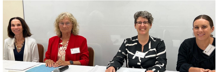
Access to Justice Conference 2023