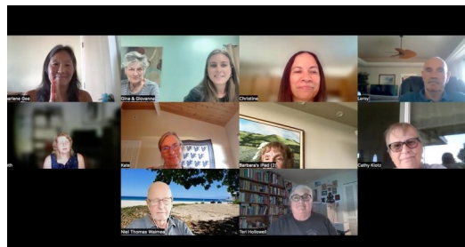
Mediator Round Table Discussion