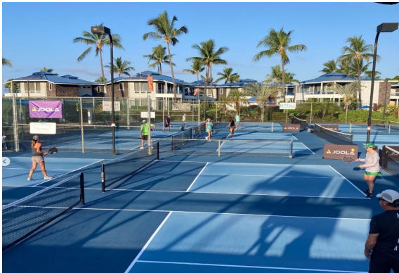
2025 Pickleball Fundraiser