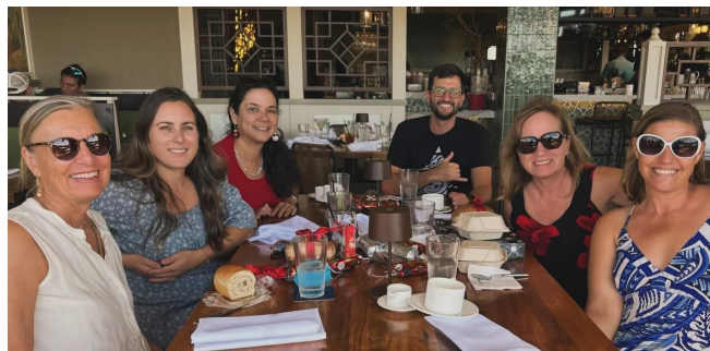
2024 Holiday Staff Lunch