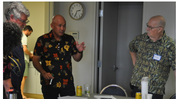
2025 Strategic Planning Meeting