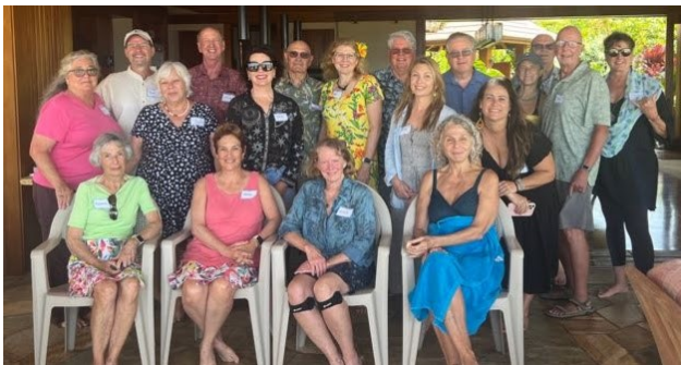
2025 Volunteer Appreciation Gathering

We are proud to celebrate the outstanding contributions of our dedicated volunteer mediators, whose efforts have made a meaningful impact over the past period. A total of 256 new cases were opened, with an impressive 105 reaching agreement, many thanks to the skill and compassion of our mediators. There were 168 mediations held, with more agreements than mediations due to successful conciliations outside of formal sessions. While 55 mediations ended without agreement, and 101 cases were closed without mediation, each case represented an opportunity for peaceful communication. Our referrals were largely self-initiated (102) and court-referred, including 94 from district court and 45 from family court. The majority of case types were domestic (112), followed by landlord-tenant (36), consumer/merchant (29), and TRO-related matters (26). A total of 39 mediators volunteered their time, and we extend our heartfelt gratitude to each of them for their unwavering commitment to fostering resolution in our community.