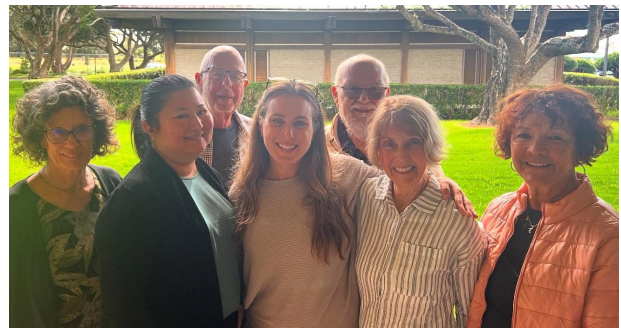
Waimea Judge Talk Story with Mediators