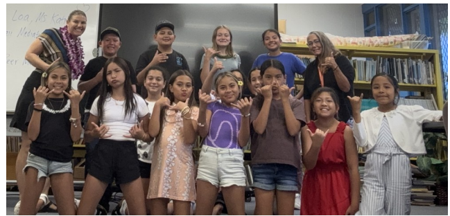
Honaunau Elementary Peer Mediation Training