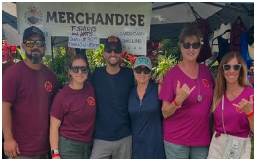
2025 WHMC Staff & Board Volunteer @ Kona Brewers Festival