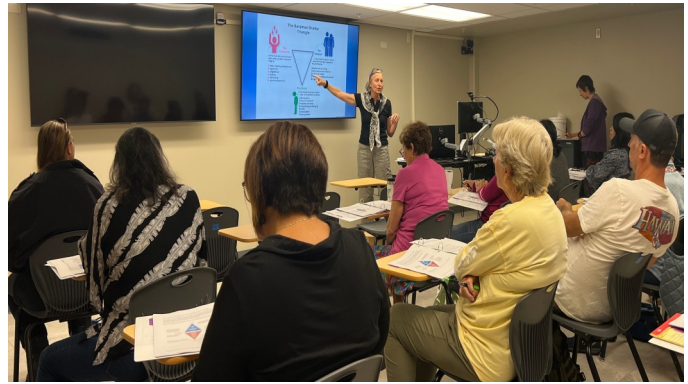
Basic Mediation Training