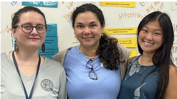
Waiakea High School Restorative Justice Outreach with The Office of the Prosecuting Attorney