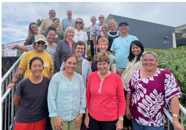
2025 Basic Mediation Trainees