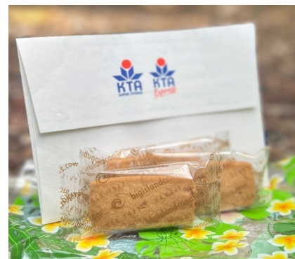
Mahalo KTA & Big Island Candies for donating to our volunteer appreciation!