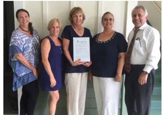
Conflict Resolution Day 2016