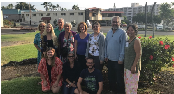
2017 Basic Mediation Training Certificate Recipients