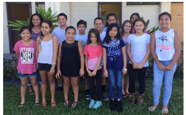
2016-17 Kohala Elementary School Peer Mediators

60% of youth in our Peer Mediation program qualify for free or reduced lunch.