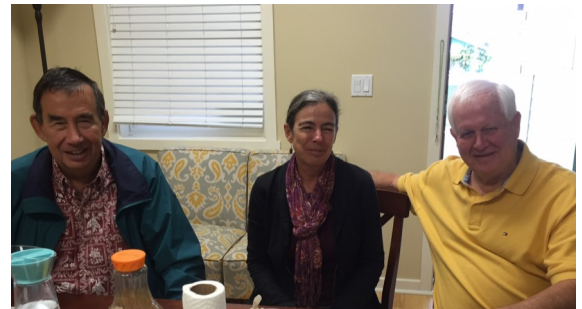
Mediator Appreciation Breakfast