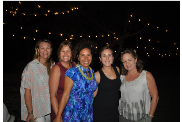
October 2016 Napua Event